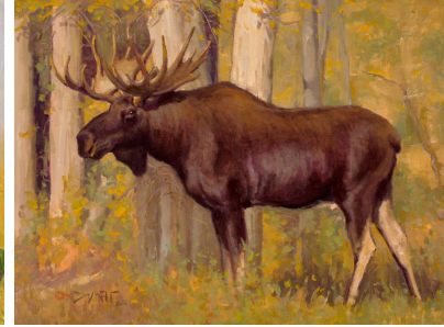
"Teton Bull" 12 x 16 Oil - $4,900 John DeMott