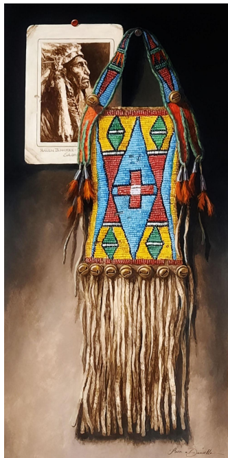
"Pride of the Plateau - Nez Perce Mirror Bag" 24 x 12 Acrylic - $4,150 Lisa Danielle