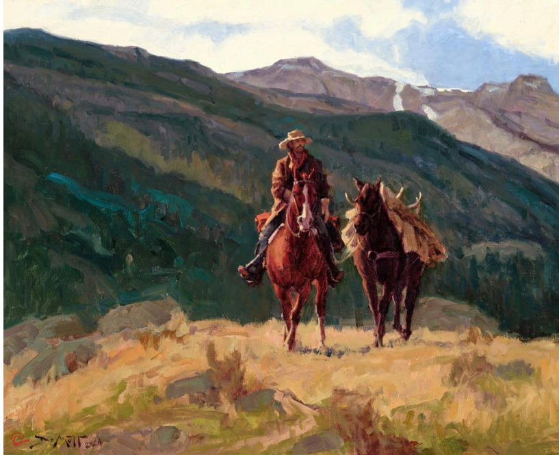
"Packing Out" 16 x 20 Oil - $8,900 John DeMott