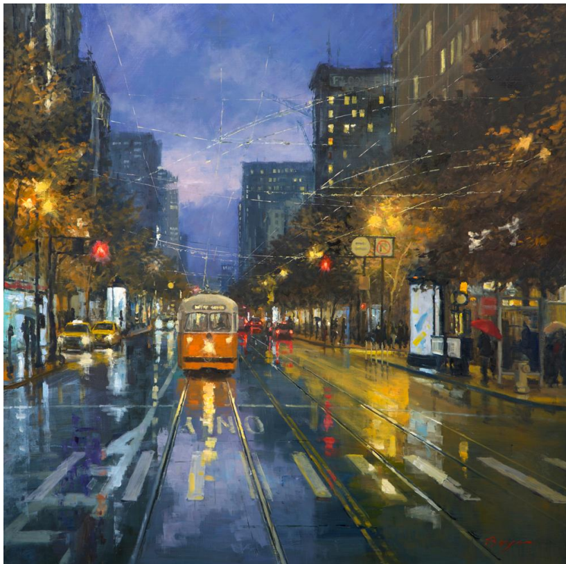
"Orange Trolley on Market" 40 x 40 Oil - $8,800 Richard Boyer

NEW ARRIVALS ON THE MOCKINGBIRD GALLERY WEBSITE