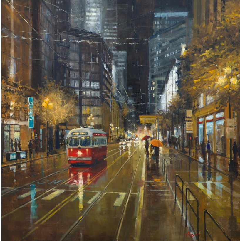
"Rainy Night on Market" 40 x 40 Oil - $8,800 Richard Boyer