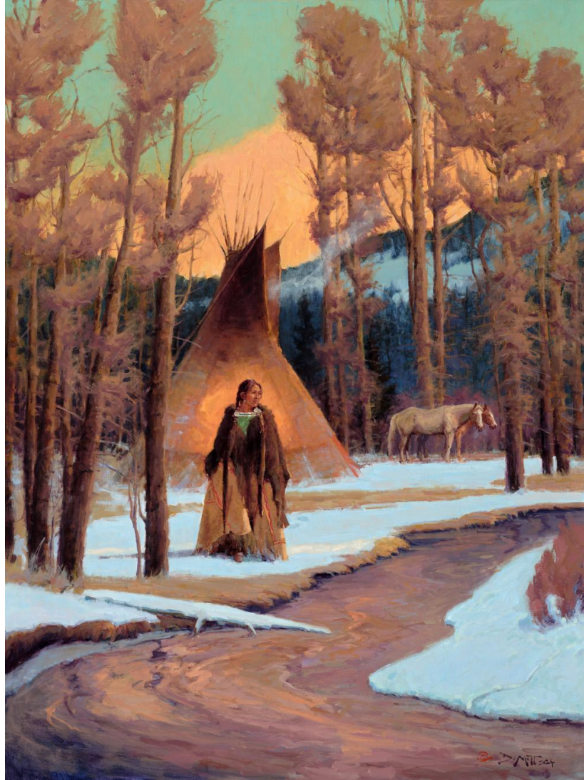
"Winter Solitude" 40 x 30 Oil - $25,000 John DeMott