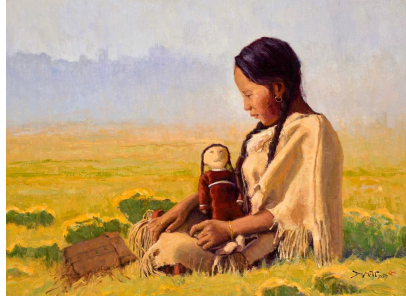
"The New Doll" 12 x 16 Oil - $4,900 John DeMott